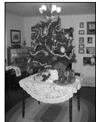
Christmas tree in the Nichols House