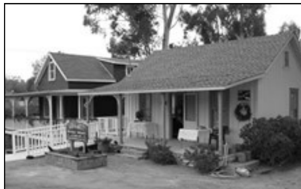
The museums on Tavern Road—notice the new ramp!

•Appeared in the Viejas Days and Crown Hills parades. (continued on page 3)