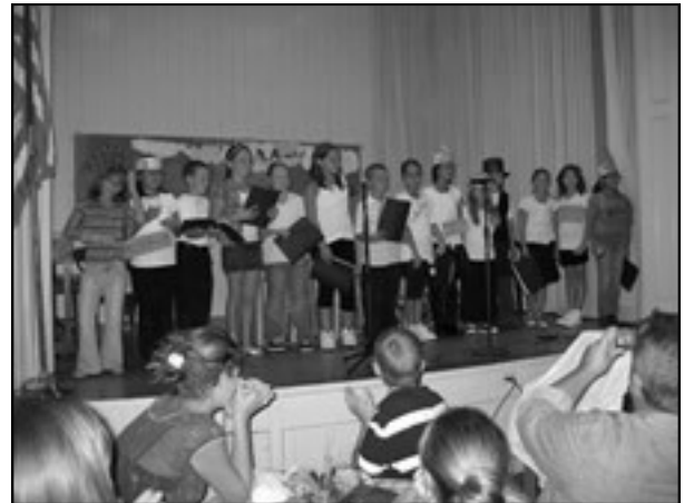
The cast takes a bow.

The play was presented to a packed house. For the first time we had to tell some folks that our reservation list was full! There was wonderful response which pleased us immensely.