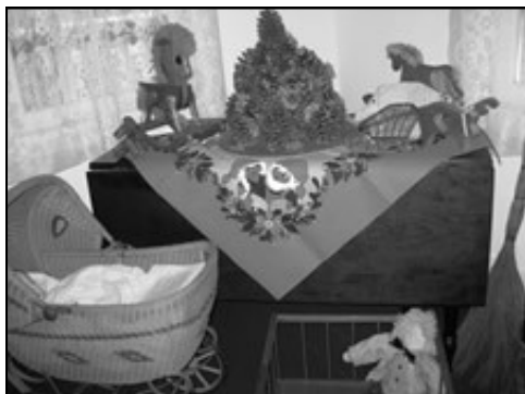
Christmas decorations in the Beaty House.