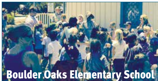
Boulder Oaks Elementary School

These students were remarkably well prepared for the tour and asked very thoughtful questions. Parents and teachers alike can be very proud of these children and their educational accomplishments.