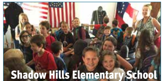
Shadow Hills Elementary School