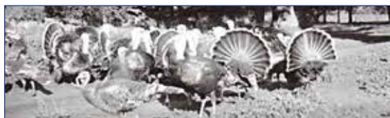
Foss turkeys at Tule Springs—1918