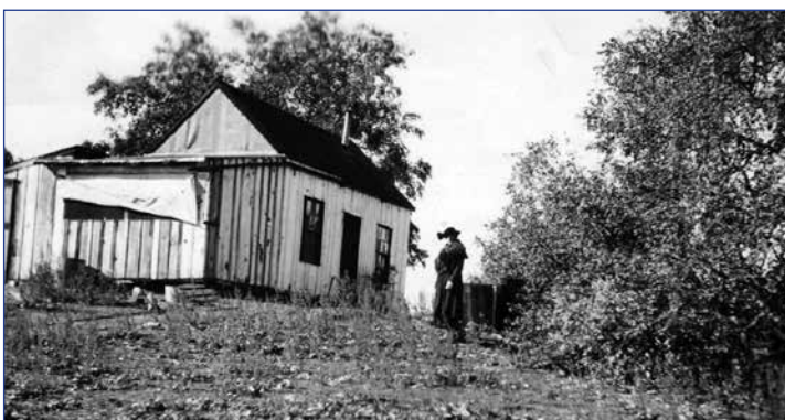
Foss' Tule Springs Home—1876