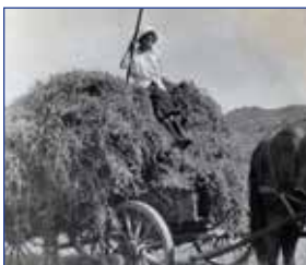
Abundant Hay crop