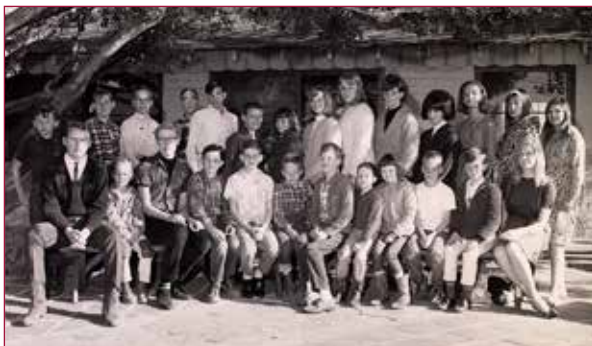
McCall's Ranch School, 1966

But, best of memories are the many friends I made in Alpine, all of whom I cherish with my Happy Memories, and continue to nurture.