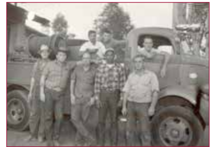
Volunteer Firemen & the First Fire Truck

Then there were all the wonderful organizations formed, especially during the war