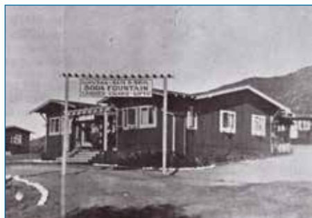
Green Parrot Tea Room