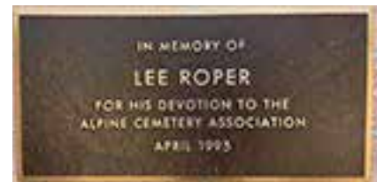
Bronze plaque on Alpine Cemetery's office wall.